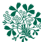
Royal Botanic Garden Edinburgh

On Behalf of Royal Botanic Garden Edinburgh