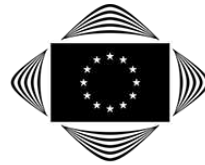
European Committee of the Regions

On Behalf of the European Committee of the Regions